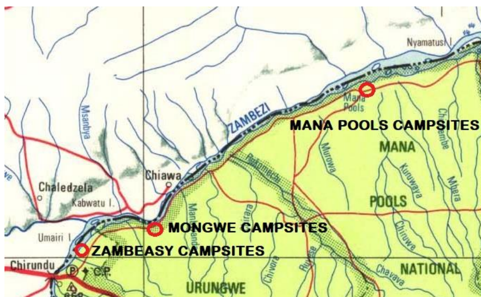
MANA POOLS EXPEDITION MAP

ZAMBEZI VALLEY SAFARIS in conjunction with Chirundu Safari Lodge, Tamarind Tented Camp and Zambeasy Camp Sites are proud to present the “MANA POOLS EXPEDITION”.